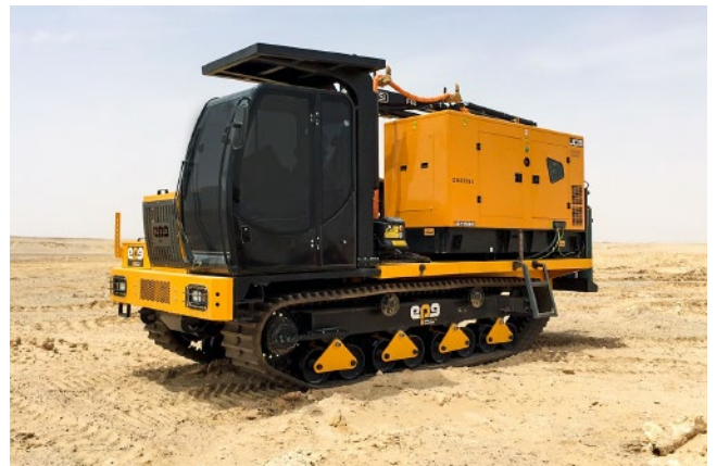
Automatic Welding Version