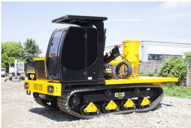
Sand Blasting Version